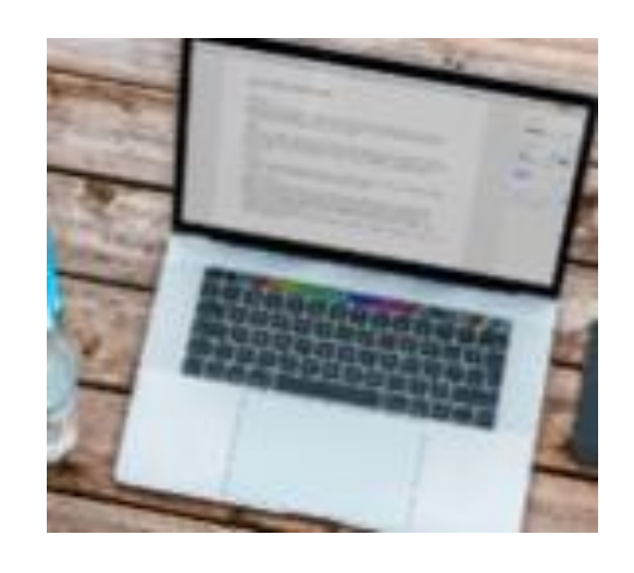
Support the Development of Digital Literacy

The use of the PLD for teaching and learning aims to: