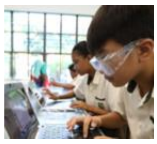
Support Self-Directed and Collaborative Learning