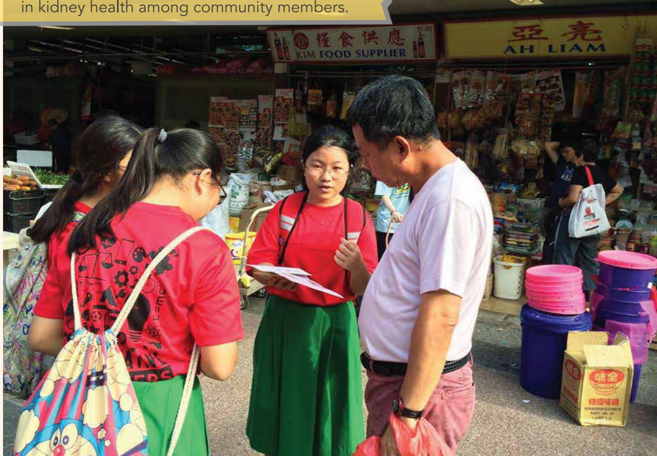
GESSians working together to spread awareness in kidney health among community members.