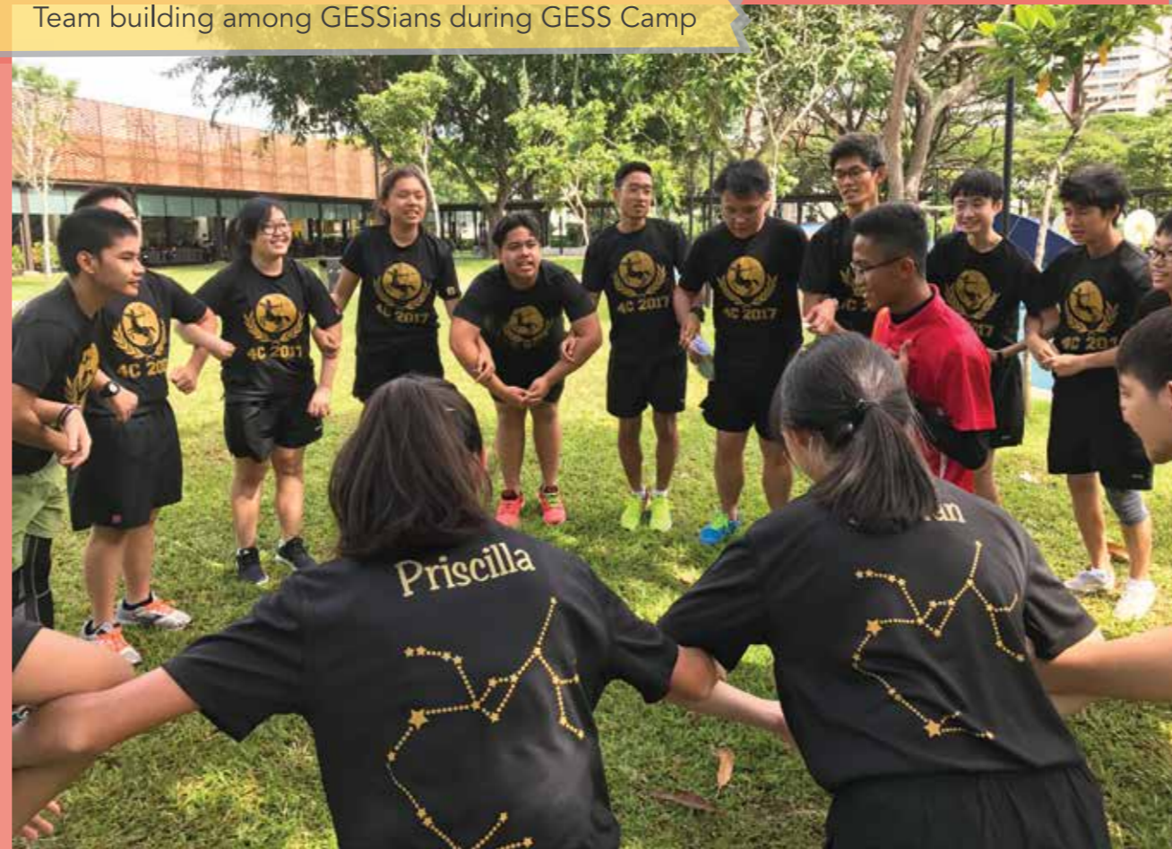
Team building among GESSians during GESS Camp

The level GESS camp is designed to forge strong camaraderie and also instil critical life skills such as team work, discipline and resilience among each cohort of Gessians.