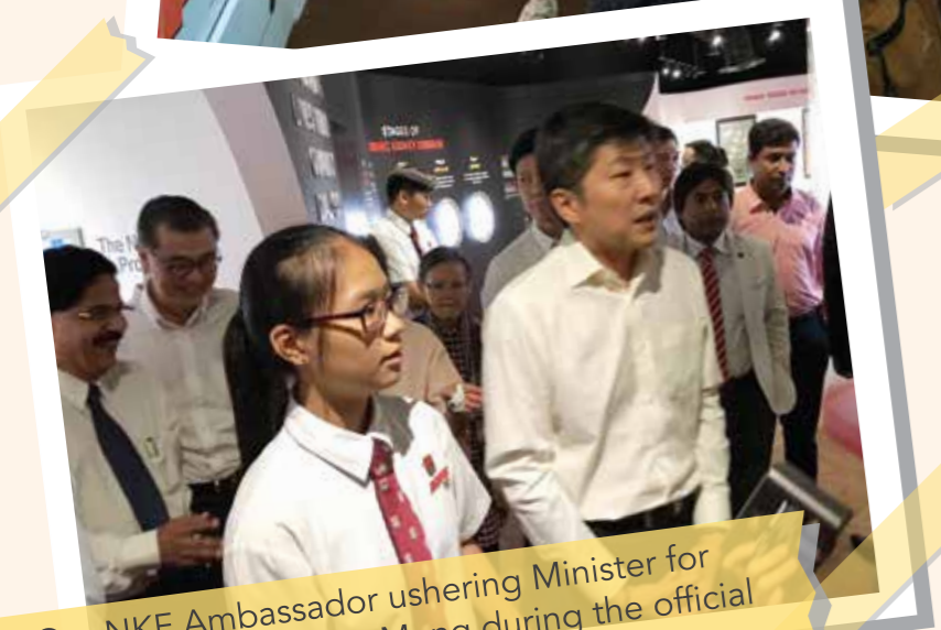
Our NKF Ambassador ushering Minister for Education, Mr Ng Chee Meng during the official opening of the Kidney Discovery Centre.