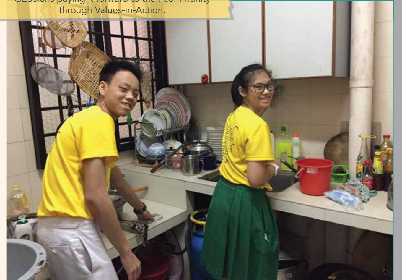
GESSians paying it forward to their community through Values-in-Action.

GESS believes that values are inculcated in both in the classrooms and beyond. Hence the planning of the Values-in-Action programme carried out each year strives to ignite GESSians' passion to actively engage and serve their community.