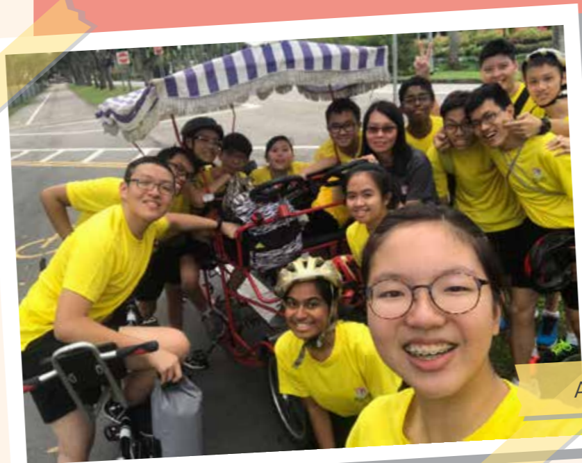
All smiles on deck!